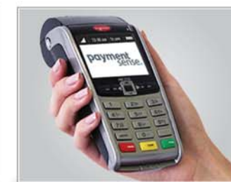
• EFT Integration.