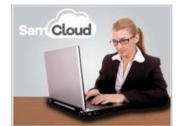
• Cloud Based Back Office Management Software.