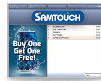
• Special Offer's displayed on Rear LCD Display.

“Easy to set up with minimal staff training”